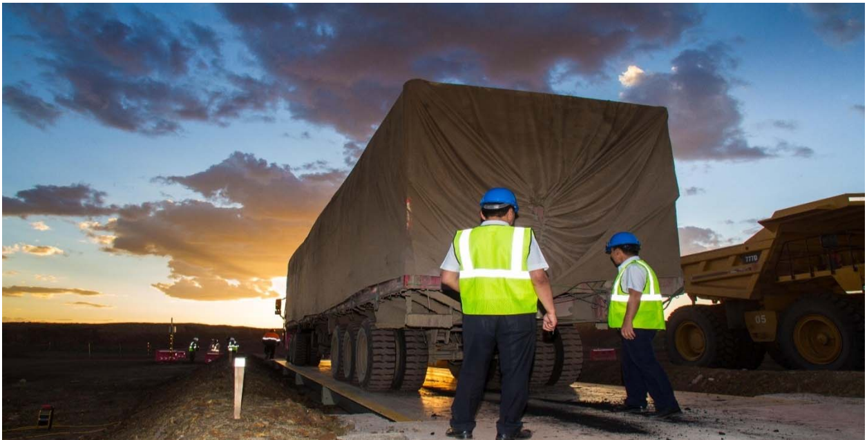
Customs' officials sign off on the first coal shipment

For further information please contact Tony Mooney, GM Stakeholder Relations on +61 423 841 259.