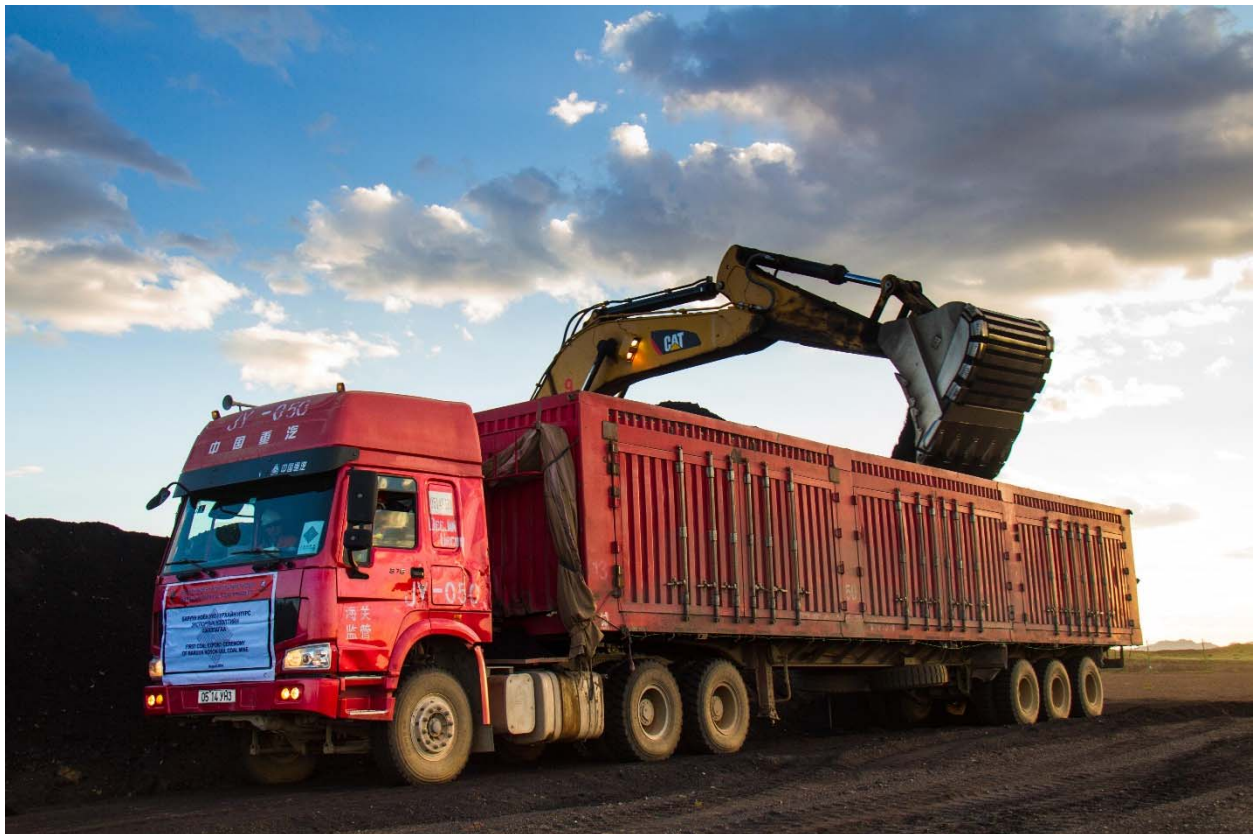
Coal loading underway

This significant milestone comes after 9 months of negotiations with regulatory approval agencies in Mongolia. The final piece of the jigsaw was sign off on a permit to utilise a 98 kilometre haul road linking the BNU mine to the Chinese border crossing at Shivee Khuren/Ceke. It signals the critical next phase of progress to a commercial mine operation.