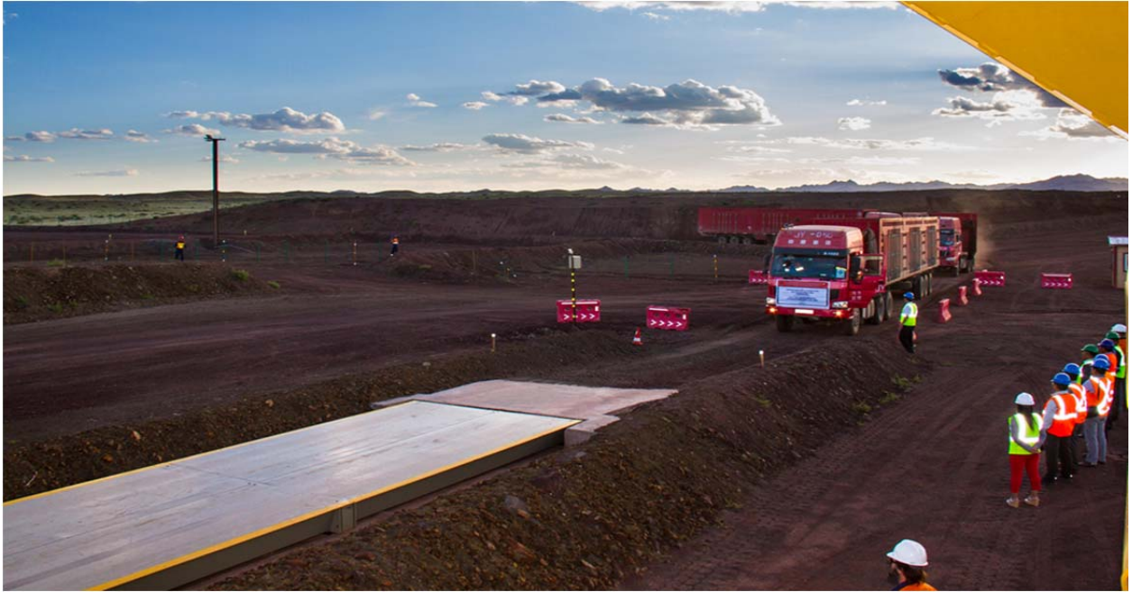
First coal from the Terra Energy BNU mine in Mongolia heads to a weigh bridge.