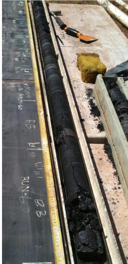
Photo of Core taken from Hole HO17 located on EPC1477 in the Hughenden Project

As previously notified to the market Guildford is on track to release its maiden JORC Underground Resource for Hughenden on EPC1477 in September / October 2011.